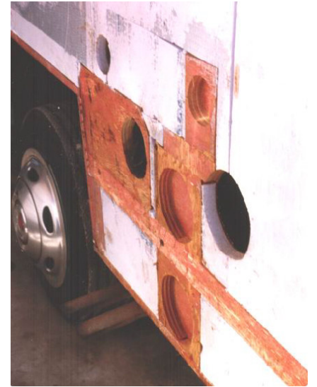
Laminate separation discovery. Notice the six holes. Mistakes covered up by the manufacturer. This is common.

The inexperienced appraiser submits an estimate for payment, the claims representative pays and everybody is happy. It is the responsibility of the insurance company to obtain competent